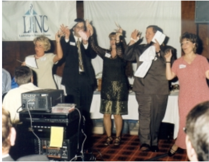
"Who could ask for anything more"...Class project presentation